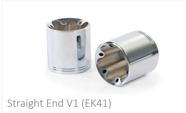
Straight End V1 (EK41)