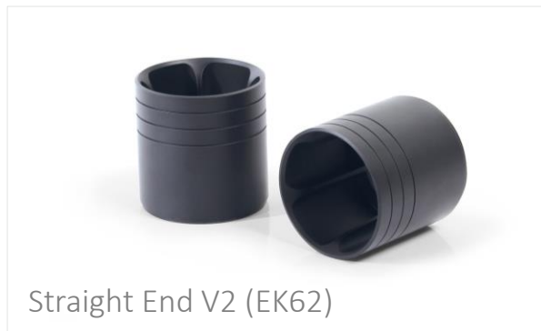
Straight End V2 (EK62)