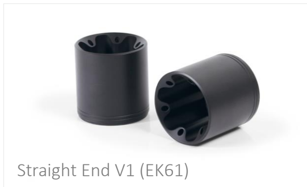
Straight End V1 (EK61)