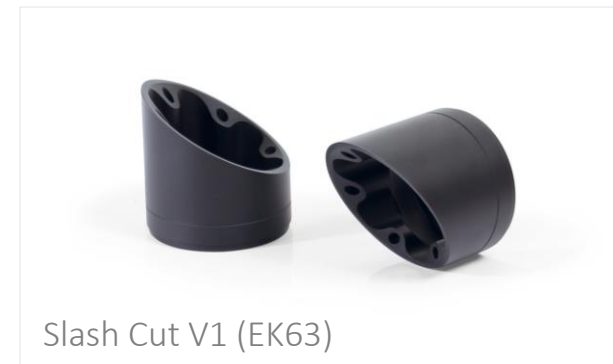
Slash Cut V1 (EK63)