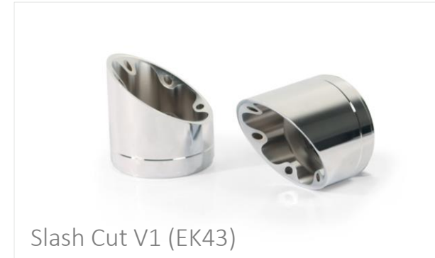
Slash Cut V1 (EK43)