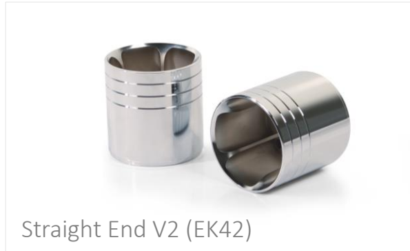
Straight End V2 (EK42)